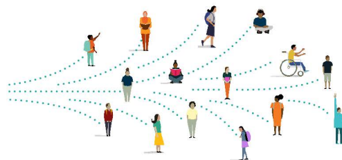
PERSONALIZED LEARNING PATHWAYS

Meeting the unique learning needs of every student has never been more complex. Educators need tools that simplify the process and save time—but don't cut teacher expertise out of the equation. To help teachers unlock learning gains, NWEA® has partnered with Khan Academy® to develop MAP® Accelerator™.